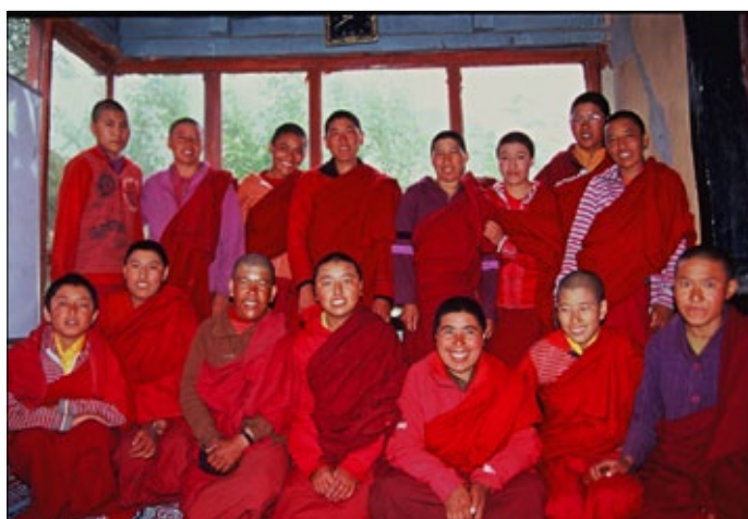
The nuns of Palmo Ling (Zangskar) in the Buddha hall that they built themselves.