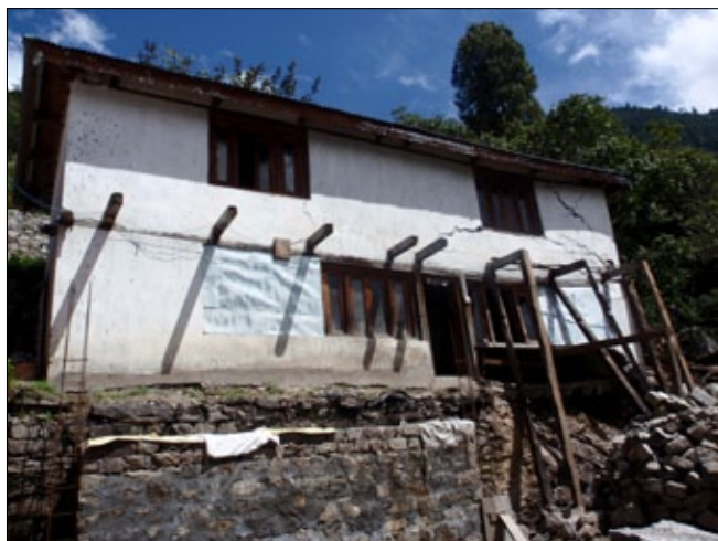
The teachers quarters at Jampa Chöling in Kinnaur collapsed in the heavy rains.

Visit the new Jamyang Foundation website at: http://www.jamyang.org