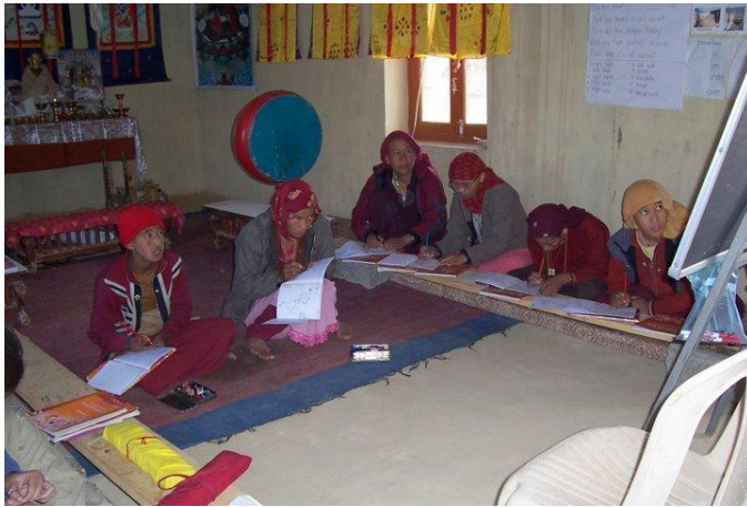
English class at Dechen Choling Monastery

The nuns at this remote gonpa had had little education, but they were a joy to teach. They approached the lessons with enthusiasm and a great sense of humor. Some of the children from the village came for lessons, too. I taught for two hours each morning. Afterwards, I had lunch with the nuns, usually rice and vegetables and plenty of tea. I liked to spend the afternoons walking and helping with the farm work. The scenery was stunning and the kindness of the villagers is something I will remember for the rest of my life. Obviously, a month was much too short to achieve anything significant. I hope that one day I will be able to return and spend a more time in Pishu.