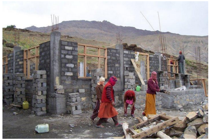
Building phase 2 at Dechen Choling Monastery