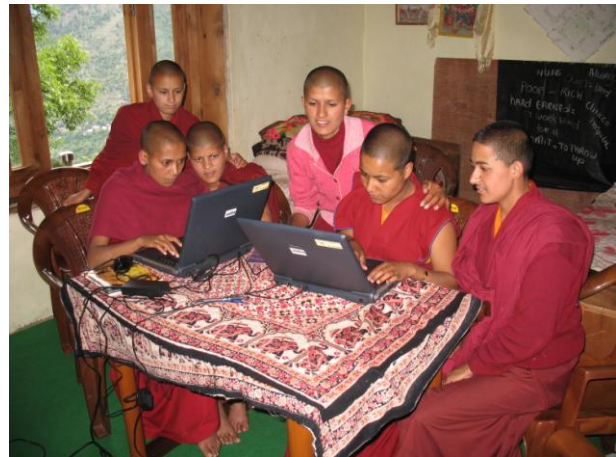
Computer class at Jampa Choling, Kinnaur