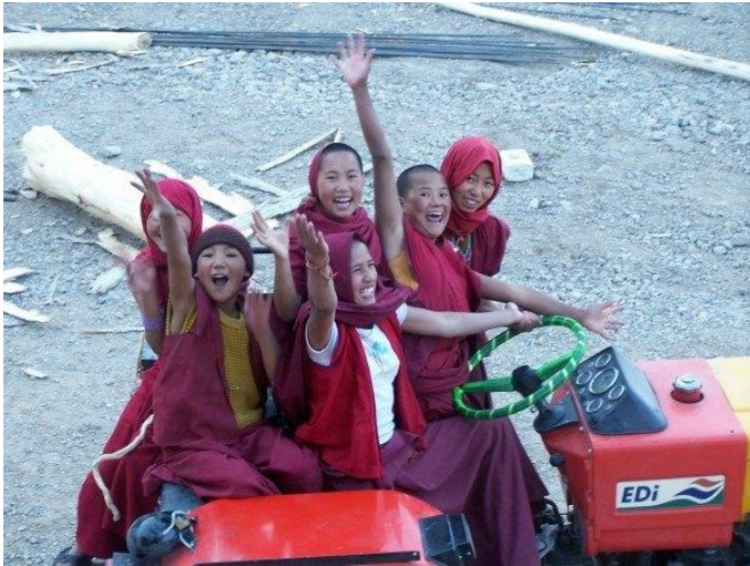
Spiti Nuns on a Tractor

The religion major in me that had hoped to see the spiritual aspect of monastic life was not disappointed. Though I never attended their morning and evening pujas or watched them in meditation, I saw their faith in everything they did. I saw it in the kindness and unconditional love that they showed me and in their completely impartial generosity and charity. Despite all that they did for me, they never expected anything in return. Even with all our different personalities, likes, and dislikes, we were united in our desire to do and be good.